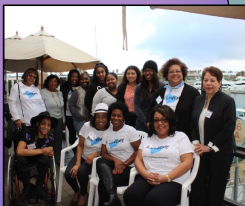
January 2016 L.O.V.E. Program Launch